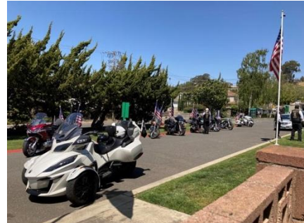
Above: The District 10 Legion Riders lined up to participate in the Lone Tree virtual event filming.

The Riders participated in several events honoring Legion members and to commemorate Memorial Day.