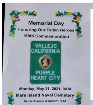
District 10 Riders (pictured above) joined the District 9 Riders to represent the ALR to honor Service Members interred at the Mare Island Naval Cemetery during the 150 th Memorial Day ceremony at that site.